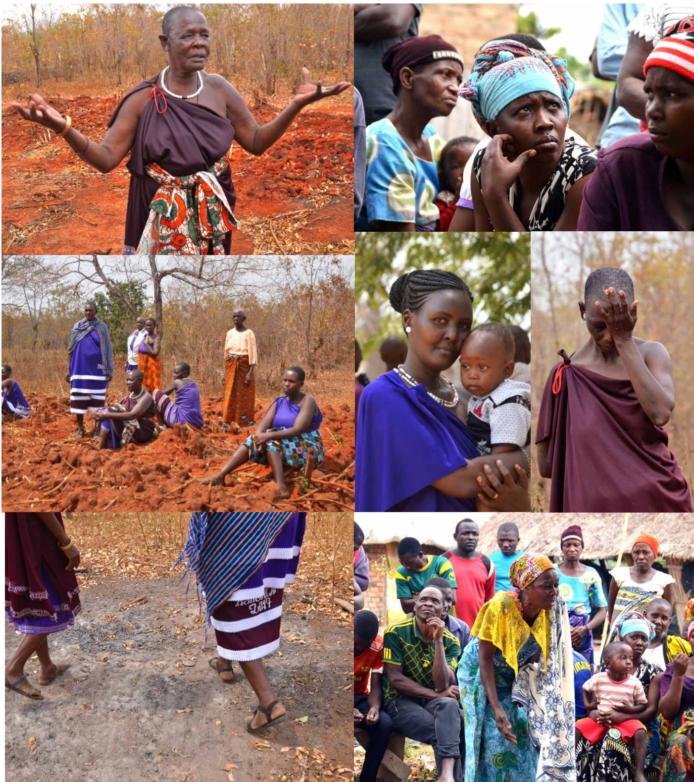
The many faces and emotions of eviction